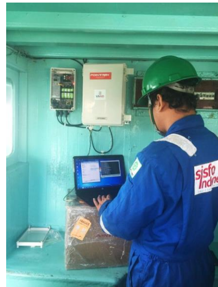
A installs the Pointrek system onboard a vessel.

In the course of the research, it also became apparent that there is a lack of integration between MMAF’s eLogbooks and other electronic data systems used on vessels. In many cases, industry members are beginning to invest in at-sea and on-land traceability technologies that offer operational efficiencies and business management benefits that the eLogbook system cannot offer. For example, eLogbook data captured by a private VMS, such as, 10 cannot feed into MMAF’s eLogbook application. Thus, Pointrek users must keep parallel, duplicate eLogbooks. Allowing data entry from other, private sector technology solutions would encourage system participation, adoption, and improved accuracy.