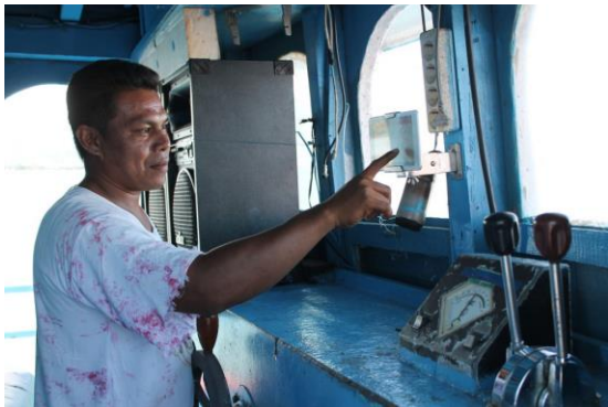
A fisher uses an onboard VMS.

Technically, eLogbooks make it possible to conduct each of these steps online without the need for the fishing company to provide any hard copies to the processor/exporter, but in practice this is not yet the case. Such streamlining would save time and money for both industry and regulators.