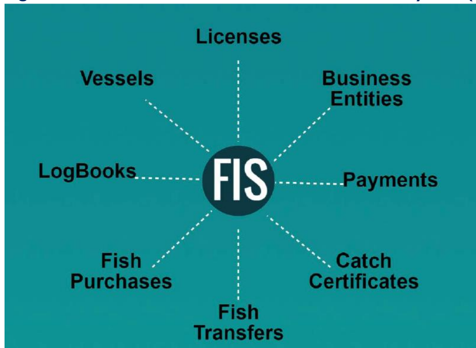
Figure 1: Overview of Maldives Fisheries Information System (FIS)

By offering an eLogbook with a streamlined, data rich application that captures information that is useful for vessel owners and captains, MMAF will boost the incentives for eLogbook compliance and support increased productivity in the fisheries industry while decreasing illegal, unreported, and unregulated fishing incidence. And by simplifying, digitizing, and integrating the catch and export documentation process while simultaneously implementing eLogbooks, both MMAF and industry actors can increase efficiency and refocus their efforts on capturing a greater share of international export markets. If executed well, eLogbook implementation, combined with a digital documentation system, will significantly improve MMAF's data collection while reducing costs for both the government and private sector.